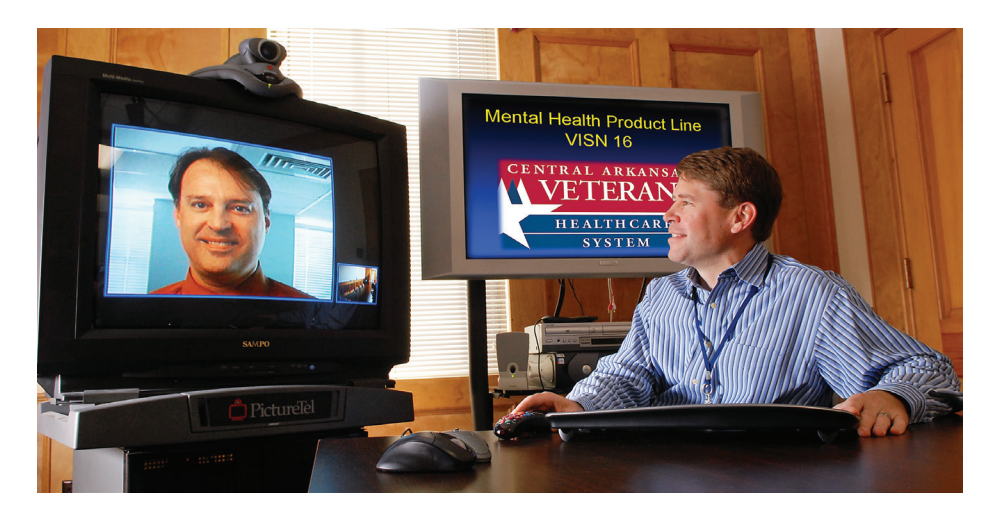
At the COIN based in Little Rock, researchers are studying how to best provide mental health care via videoconferencing, among other topics.

Indianapolis, Ind.; Iowa City, Iowa; Los Angeles, Calif.; Minneapolis, Minn.; North Florida/South Georgia and Tampa; North Little Rock, Ark.; Palo Alto, Calif.; Pittsburgh and Philadelphia, Pa.; Portland, Ore.; Providence, R.I.; Salt Lake City, Utah; Seattle, Wash.; Denver, Colo.; and West Haven, Conn. (Three of the COINs are partnerships between two different VA medical centers.)