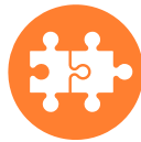
VA and DoD Collaboration

To help rural Veterans thrive in their communities, the Office aligns all of its activities to VA's priorities and ORH's strategic plan to identify, support and disseminate innovative health care solutions. In partnership with internal and external stakeholders, ORH initiatives support customer service, MISSION Act implementation and business transformation by increasing availability of care, incorporating community care partners into integrated solutions and deploying advanced technology.