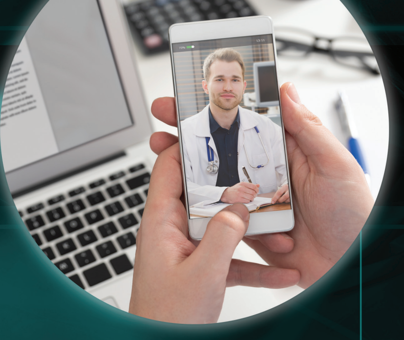
Continuity of care