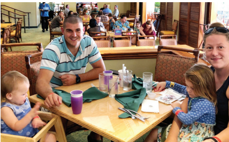
THE FOUNDATION HOSTED A HOLIDAY DINNER AT HONOLULU'S HALE KOA HOTEL FOR COAST GUARD FAMILIES DISPLACED FOR MONTHS BY CONTAMINATED WATER.

448 COAST GUARD FAMILIES ASSISTED WHEN THEY WERE MOST IN NEED