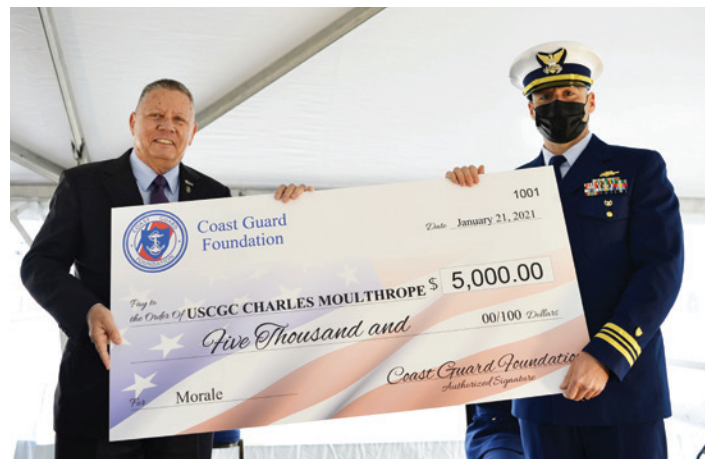
CGC CHARLES MOULTHROPE , COMMISSIONED IN PORTSMOUTH, VIRGINIA, IN JANUARY, RECEIVED $5,000 TO ESTABLISH A MORALE AND WELLNESS FUND.

Supporting wellness for Coast Guard members enhances their service and helps them cope with the challenges of their demanding duties. We piloted a national partnership with the Coast Guard Chaplain Program to help families connect and build positive, supportive relationships as well as an effort in the Northeast to combat the alarming number of military suicides through peer training. The crew of each new cutter brought into service received a grant to establish their morale and wellness priorities.