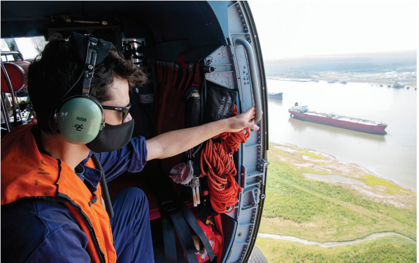
WHEN HURRICANE IDA WROUGHT DEVASTATION FROM LOUISIANA TO NEW ENGLAND, THE COAST GUARD FOUNDATION RUSHED EMERGENCY AID TO THOSE COAST GUARD MEMBERS IMPACTED. IN THIS PHOTO, A COAST GUARD MARINE SCIENCE TECHNICIAN SEARCHES FOR POLLUTION DURING AN OVERFLIGHT IN LULING, LOUISIANA, ON SEPTEMBER 3, 2021.