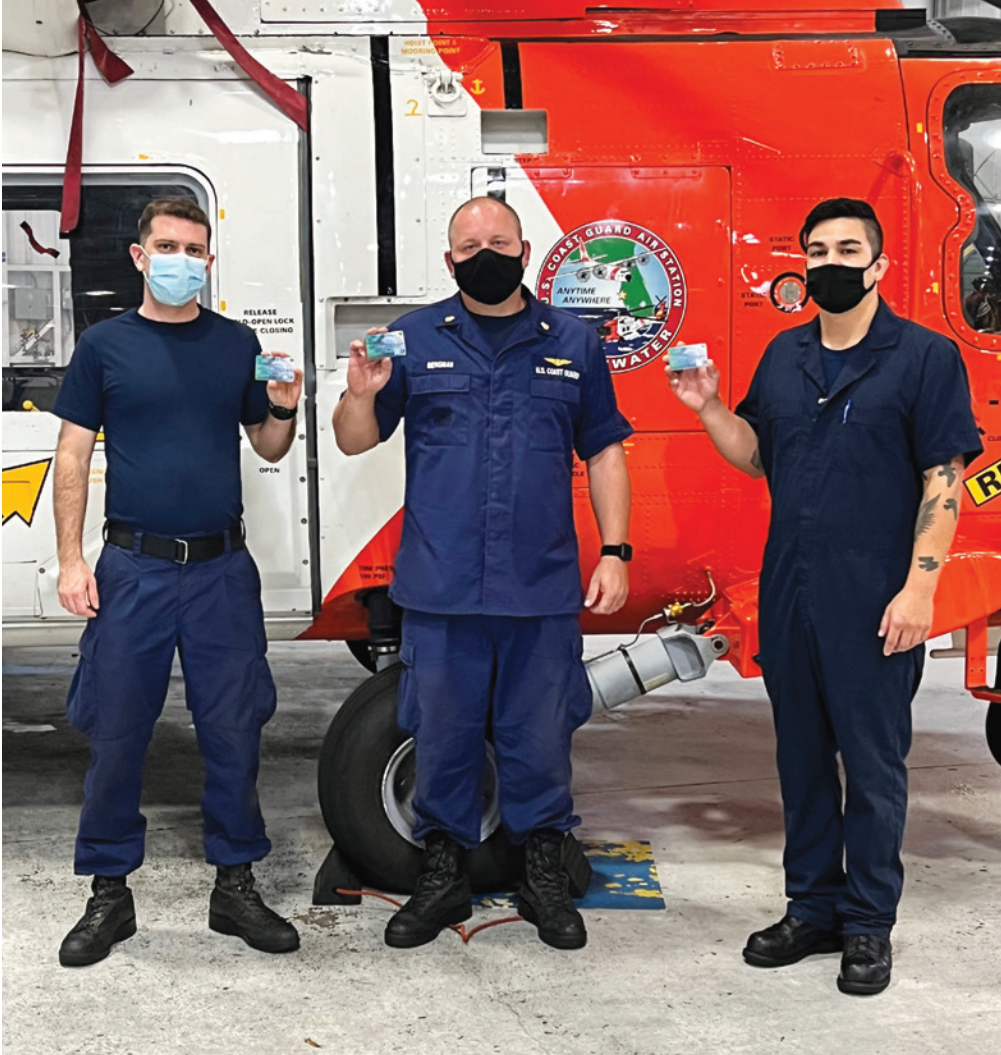
COAST GUARD MEMBERS FROM AIR STATION CLEARWATER RECEIVED THEIR AIRFRAME AND POWERPLANT LICENSES THROUGH CERTIFIED COURSEWORK FUNDED BY THE FOUNDATION. PROFESSIONAL TRAINING PROGRAMS ALLOW COAST GUARD MEMBERS TO MAKE USE OF VALUABLE SKILLS DURING THEIR SERVICE AND BEYOND.

602 COAST GUARD MEMBERS AND SPOUSES ASSISTED THROUGH OUR WORKFORCE DEVELOPMENT PROGRAMS