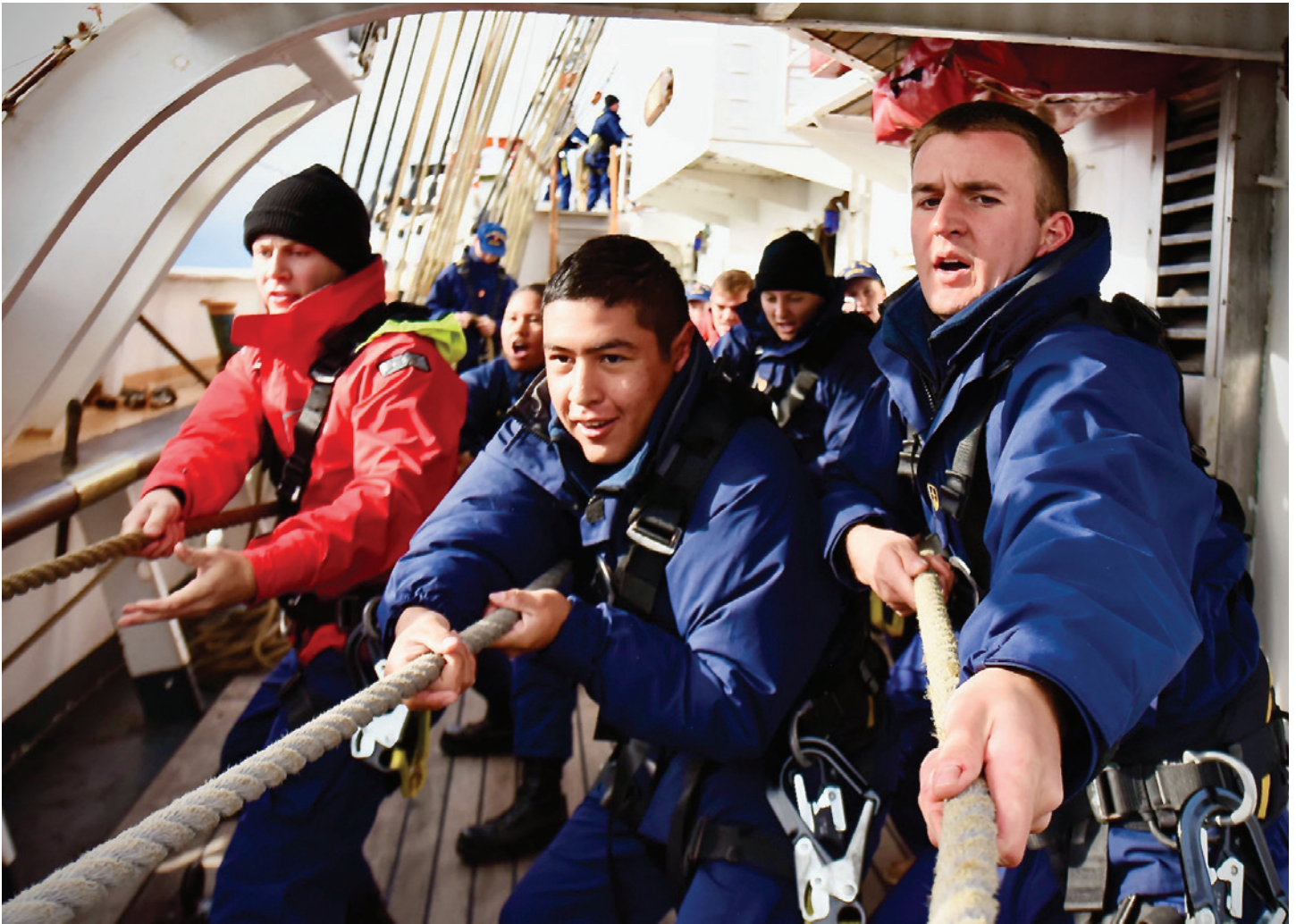
COAST GUARD ACADEMY CADETS TAKE PART IN AT-SEA SAIL TRAINING AND LEADERSHIP AND PROFESSIONAL DEVELOPMENT ABOARD THE COAST GUARD CUTTER EAGLE EACH SUMMER. IN 2021, CADETS SAILED TO PORTUGAL, ICELAND AND BERMUDA, AS WELL AS SEVERAL U.S. PORTS.