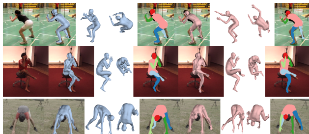
Figure 4: Results with and without paired 3D supervision. 3D reconstructions, without direct 3D supervision, are very close to those of the supervised model.

Results are shown in Table 4. Our results are comparable to the SMPLify oracle [20], which uses ground truth segmentation and keypoints as the optimization target. It also out-performs the Decision Forests of [20]. Note that HMR is also real-time given a bounding box.