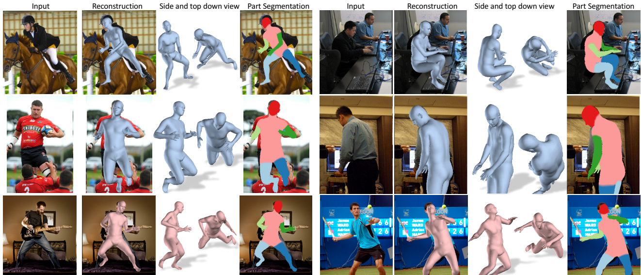
Figure 1: Human Mesh Recovery (HMR): End-to-end adversarial learning of human pose and shape. We describe a real time framework for recovering the 3D joint angles and shape of the body from a single RGB image. The first two rows show results from our model trained with some 2D-to-3D supervision, the bottom row shows results from a model that is trained in a fully weakly-supervised manner without using any paired 2D-to-3D supervision. We infer the full 3D body even in case of occlusions and truncations. Note that we capture head and limb orientations.

{kanazawa,malik}@eecs.berkeley.edu, black@tuebingen.mpg.de, djacobs@umiacs.umd.edu