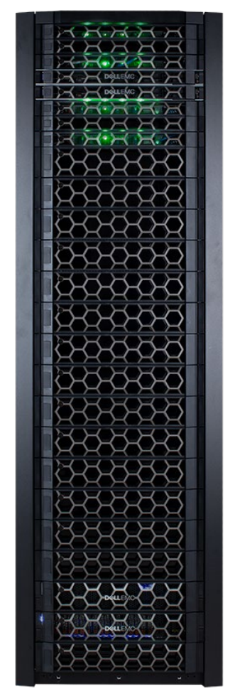
Dell APEX Data Storage Services solution

The HPE storage array arrived in our data center in several boxes on a pallet. The HPE field service technicians unboxed and installed the array and powered it on. After a brief initial configuration, they gave us login credentials, verified that we could log into the array, and left. This process took approximately three hours. After the technicians completed the installation and initial configuration, HPE began the process of activating the array so that they could begin importing it into the three consoles that comprise the GreenLake solution: