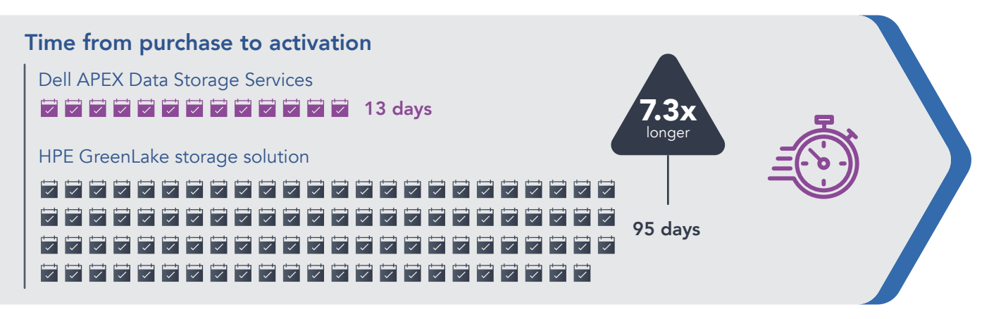
Figure 2: Time from purchase to activation for the two Storage as-a-Service solutions.

The delivery process for the HPE GreenLake storage solution took 7.3 times longer—the time from purchase to activation in our data center took over three months, or 95 days. (See Figure 2.)