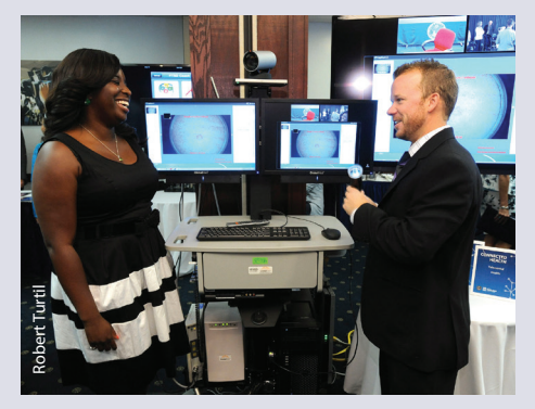
VA has been expanding the use of telemedicine. VA experts showed some of the technology to journalists at a 2013 event at the National Press Club.

Telemedicine found to be an effective tool to screen for diabetic eye disease —The Sept. 1, 2014, issue of JAMA Ophthalmology included the results of a study on the effects of a diabetic teleretinal screening program on eye care use and resources. One of the study's