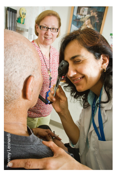
A PACT team in action at the Philadelphia VA Medical Center.

significant relationship with increased emergency room visits, especially if that provider was the sole (or nearly the sole) provider of a patient's care.