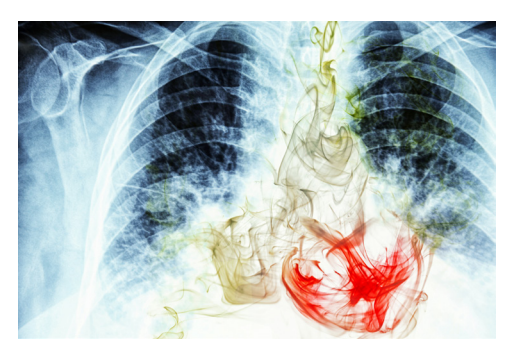
Patients who are at low-risk for lung cancer may be able to defer screening, according to VA researchers.

The results of this study are in line with conclusions from the VA <u>PIVOT</u> study, which found that surgery did not result in a significantly lower death rate than observation for treatment of prostate cancer.