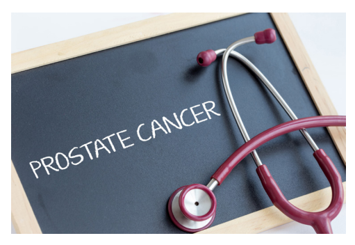
In consultation with their doctors, more Veterans with prostate cancer are choosing to skip immediate surgery in favor of watchful waiting, according to a VA study.