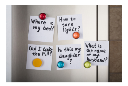
VA researchers are developing a videobased intervention designed to improve the interpersonal skills of family members caring for Veterans with dementia.

As the number of Veterans with dementia increase, there will be greater demand on family caregivers. Caregiving, while potentially meaningful, has been associated with greater rates of depression, anxiety, and physical stress. A team of researchers at the VA NY Harbor Healthcare System will develop a telehealth <u>intervention</u> to improve conflict-management skills for caregivers of Veterans.