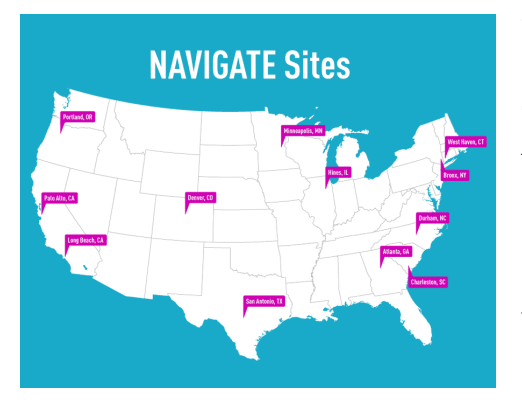
VA is partnering with the National Cancer Institute to broaden access to clinical trials for Veterans. The program is launching at 12 VA facilities throughout the U.S.