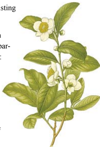
Illustration courtesy of Missouri Botanical Garden