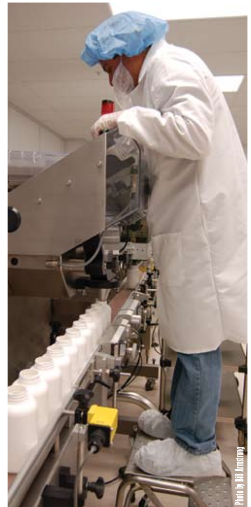
On the line —Production at VA's Clinical Research Pharmacy Coordinating Center.