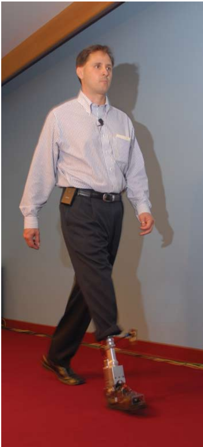
Hugh Herr, PhD, the inventor of the Powered Ankle-Foot and himself a double below-the-knee amputee, demonstrates the device at the Providence VA Medical Center.

‘This design releases three times the power of a conventional prosthesis. ...’