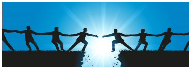
Novel statistical approaches can bridge group and individual analyses to advance individualized medicine

Dr. Kurz and colleagues suggest that the dynamic p-technique may be the solution for this systemic problem. The dynamic p-technique is a factor analytic statistical approach for multivariate individual-level analysis employing a structural equation modeling framework. This approach can allow researchers to test the influence of multiple variables at the individual level while at the same time being able to scale back to larger group generalizations. Because, relative to other statistical frameworks, this technique has the unique strength of allowing for analyses across the full spectrum of single-case data, small-n data, and large-scale group data, the dynamic p-technique could be an ideally-suited approach to bridge the advantages of both group and individual level analyses. This work, which has already received national attention, may be an important foundation as the VA helps advance the individualized medicine approach to provide optimal comprehensive healthcare.