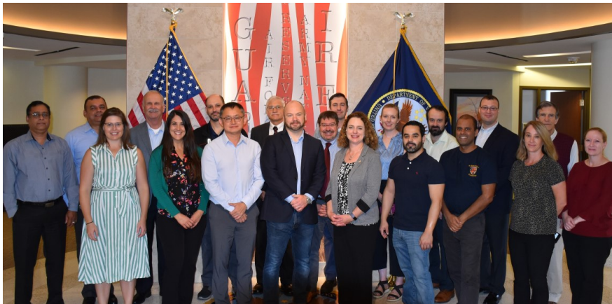
Researchers from different fields came together to work on how diverse technologies can be integrated to promote individualized treatment