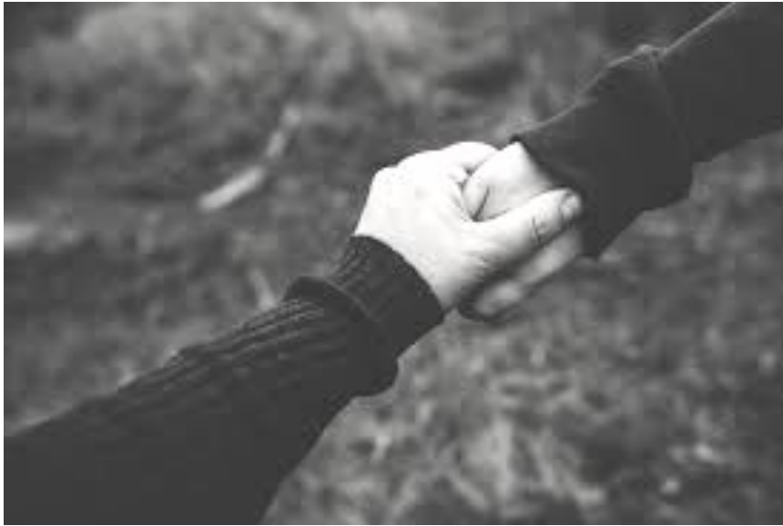
Support from a trusted friend or loved one may substantially help a Veteran cope with suicidal thoughts