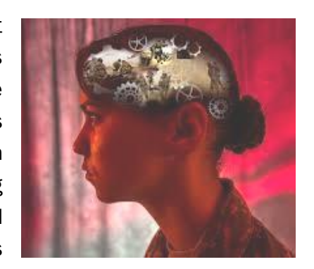
PTSD contributes to Veterans' struggles to re-adjust to civilian life

Although no unequivocal conclusions can be drawn at this time, given that data is currently being analyzed across the four sites, positive changes were observed in the lives of many of the Veterans that completed the study. In some cases, Veterans saw partial remission of symptoms in as little as six sessions. Study investigators reported that faster-paced PE can be helpful for soldiers that are in between deployments, recently returning Veterans who would like to process through their combat-related difficulties to more successfully re-integrate to civilian life, and for Veterans who would struggle committing to a trauma-based treatment over an extended period of time. Samantha Synett, a CoE study therapist, said that