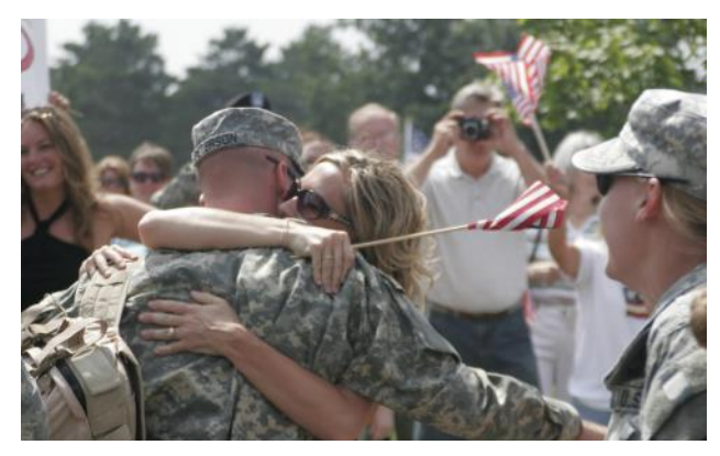
Veterans often rely on spouses and romantic partners as a source of support after returning from deployment

Romantic relationships can be a crucial source of support for Veterans returning from deployment, helping them cope with readjustment. However, mental health issues like PTSD and depression often negatively impact social relationships. Considering the key role that support from an intimate partner could play in facilitating recovery, a team of investigators from the Center of Excellence and their colleagues closely examined how relationship impairment and PTSD symptoms are associated over time.