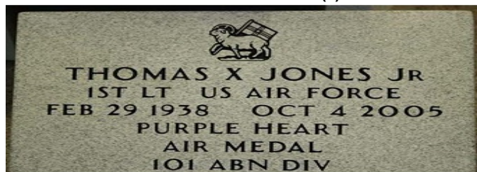
SMALL FLAT GRANITE (L)

This grave marker is 18 inches long, 12 inches wide, and 3 inches thick. Weight is approximately 70 pounds. Variations may occur in stone color.