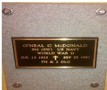
BRONZE NICHE (Z)

This niche marker is 8-1/2 inches long, 5-1/2 inches wide, with 7/16 inch rise. Weight is approximately 3 pounds; mounting bolts and washers are furnished with the marker. Used for columbarium or mausoleum interment. Also provided to supplement a privately-purchased, permanent and durable headstone or marker for eligible Veterans who died on or after November 1, 1990 and are buried in a private cemetery.