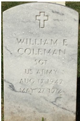
UPRIGHT HEADSTONE WHITE MARBLE (U) OR LIGHT GRAY GRANITE (V)

This headstone is 42 inches long, 13 inches wide and 4 inches thick. Weight is approximately 230 pounds. Variations may occur in stone color, and the marble may contain light to moderate veining.