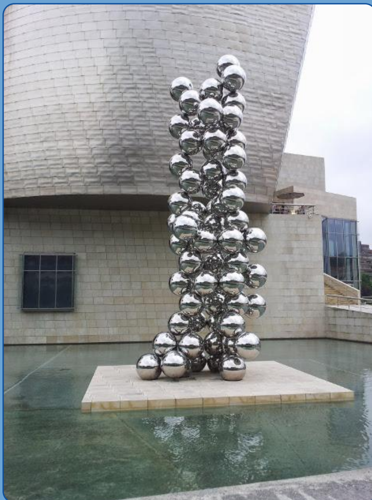
Akademy 2013 Bilbao, the Basque Country

Created 1 kde.org mailing-lists: kde-speech