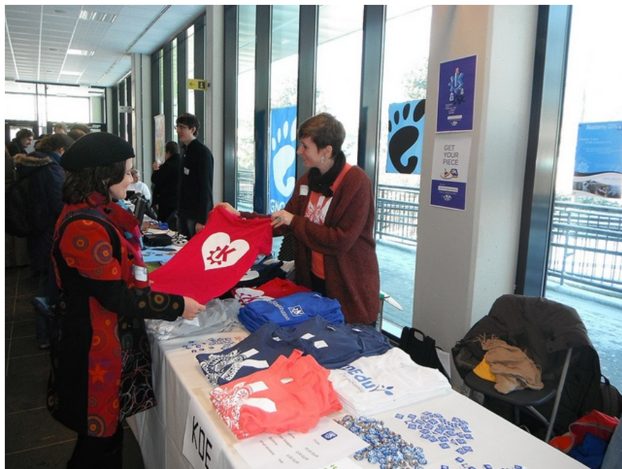
KDEWear at FOSDEM

As in recent years, KDE had a large presence at FOSDEM. There were more than 20 KDE folks present, staffing the KDE booth, milling in the hallways or giving talks in the Cross-Desktop Devroom.