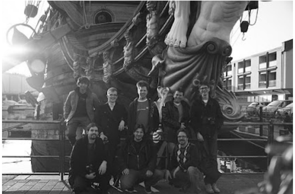
digiKam Sprint Team

may involve quality loss.) Thanks to this work, digiKam also gained multi-threaded metadata editing to go along with multiple-core CPUs. "I figured out a way to distribute the work—based on inter-thread Qt signals and slots—to multiple threads without having to change the existing code. The solution