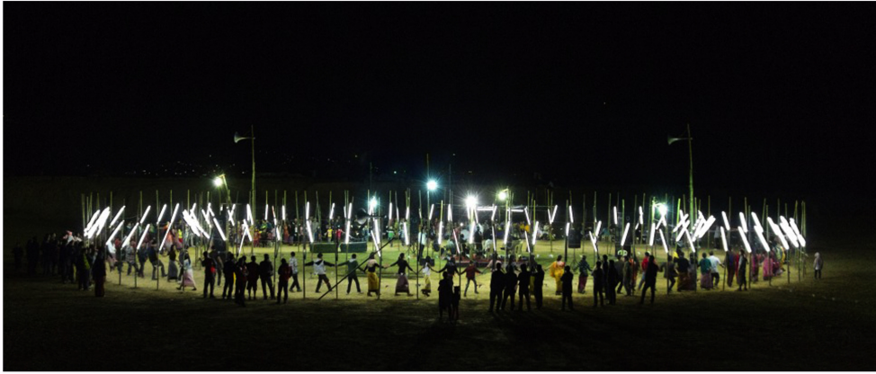
Thabal Chongba (literal meaning: Moonlight Dance) plays an integral part of Yaoshang festival.

numit' (Pichkari day). This joy and excitement of playing with colours do not dip till the fifth or the last day of the festival. Other customs that we observe in the region are taking out a procession to a local temple, playing with colours and offering prayers to the deity.