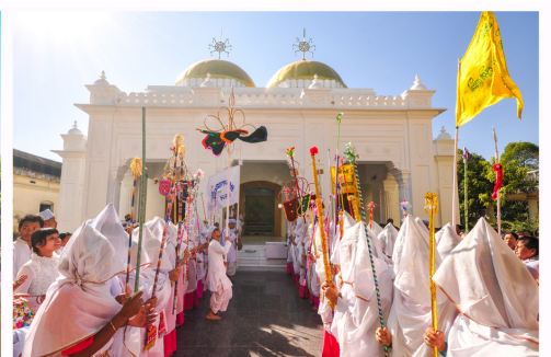
People from all across Manipur gathers at Shree Shree Govindajee Temple to celebrate Yaoshang.