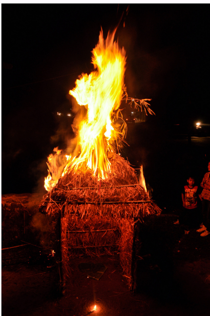
The burning of "Yaoshang" marks the beginning of the five-day long festival.

Colours are one of the significant aspects of the festival; people apply colours on the faces of each other ( aber teinaba) and children splash water among themselves with water guns (pichkari). The second day of Yaoshang is also better known as the ' Pichkari