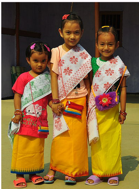
Little girls in traditional attires getting ready for "Nakatheng".