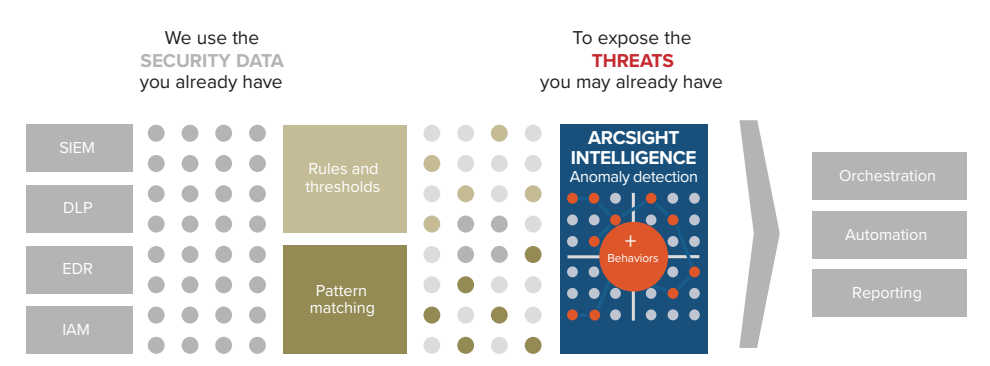
Figure 1. ArcSight Intelligence views your existing security data through a new lens in order to identify hidden threats by looking for anomalous behavior. This produces high-quality threat leads, allowing your security teams to respond and remediate quickly and effectively.

Using unsupervised machine learning—a type of artificial intelligence (AI) that doesn't need labels—ArcSight Intelligence's algorithms extract available entities (users, machines, IP addresses, servers, printers, etc.) from