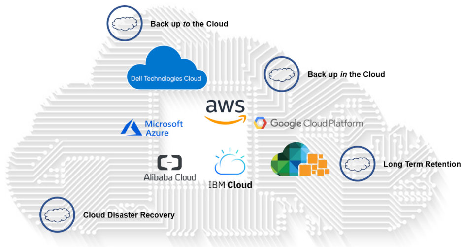
FIGURE 3: DATA PROTECTION IN THE CLOUD