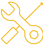
CTO/Architecture & Design