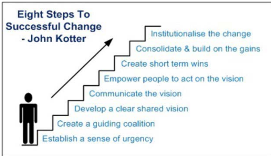
Figure 1.1 Kotter’s Eight Steps to Major Change