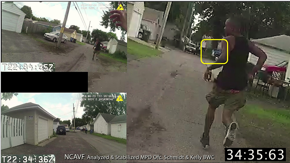
Frame 1 (top photo): The bumper, hubcap, and headlight frame of the blue plumbing truck are clearly seen in the yellow square.