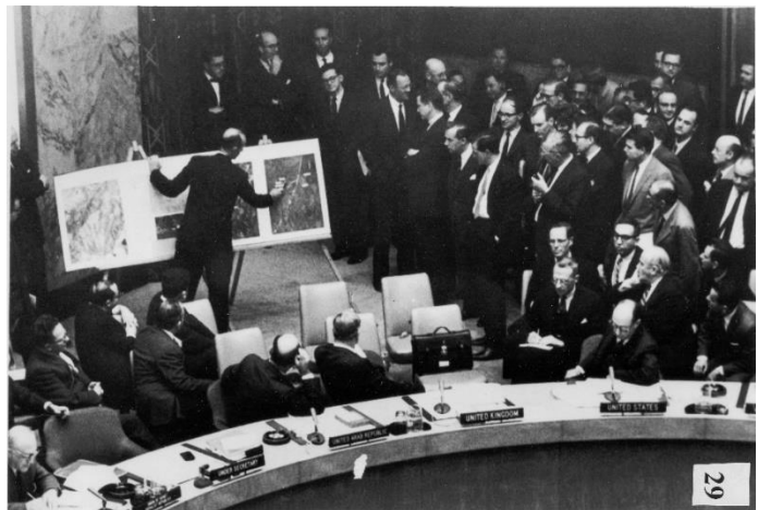
US ambassador to the UN Adlai Stevenson presents evidence of Soviet missiles in Cuba at the UN Security Council on October 25, 1962.