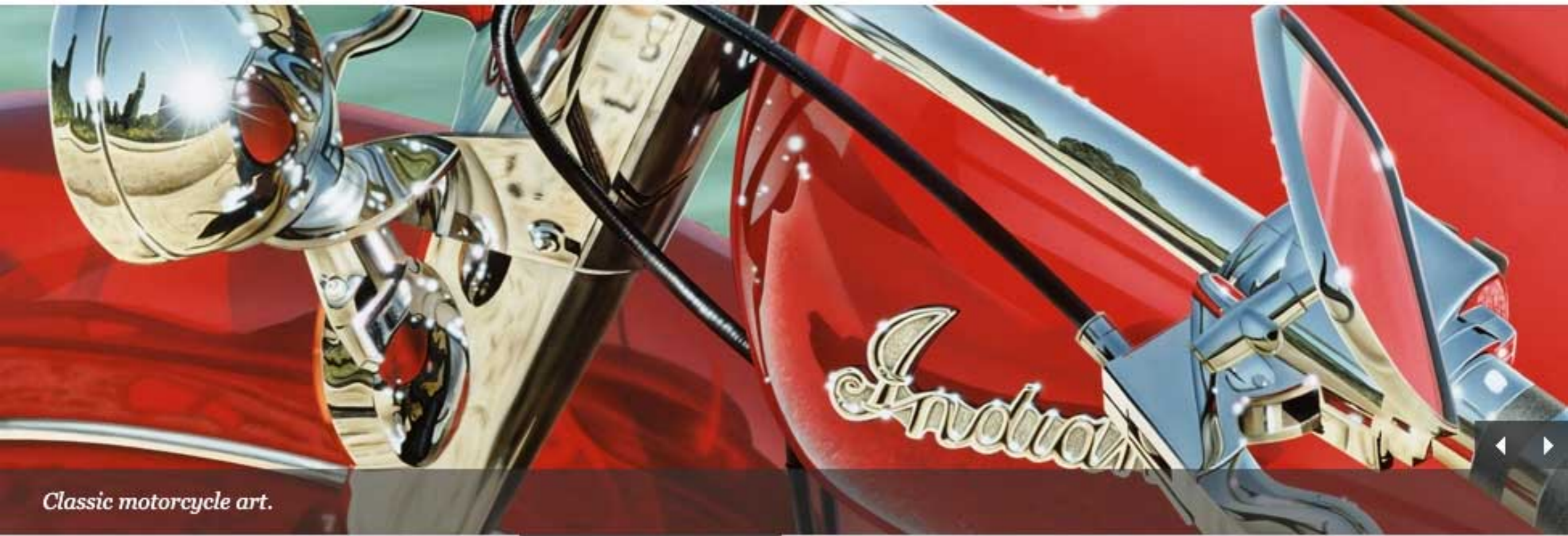
Classic motorcycle art.

Your art is a reflection of your dreams, stories and memories.