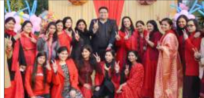
New Year Celebration