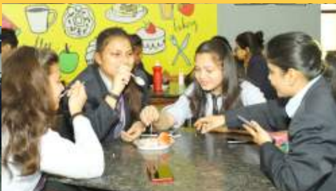
Leisure time in Cafeteria