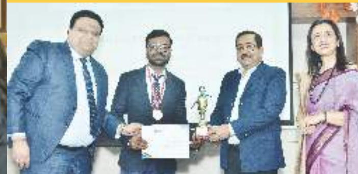
Student Felicitation Ceremony