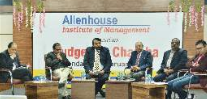
Budget Pe Charcha