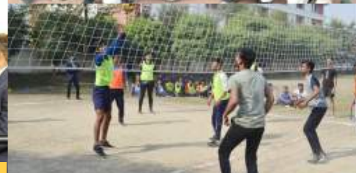
Exciting & Fun Filled Sports Activities