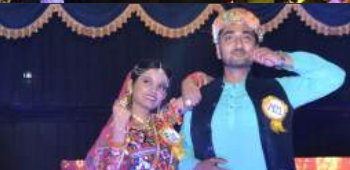
Display of Talent in Reeth-The Fresher's Party