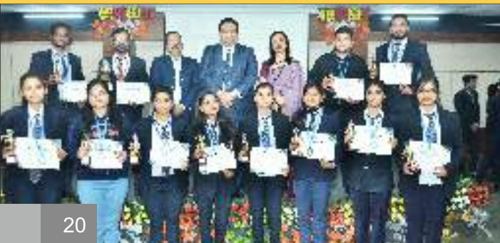
Mechanical Students in Robo-War