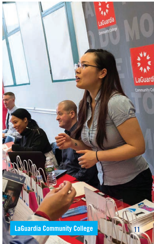
LaGuardia Community College