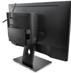
WYSE 5070 BEHIND THE MONITOR MOUNT FOR E- SERIES MONITORS

Completely open your workspace with a behind-the-monitor mounting solution.