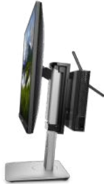
DELL P SERIES & U-SERIES MONITOR MOUNT

Recommended Options & Accessories 8 for Wyse 5070 with Dell Hybrid Client