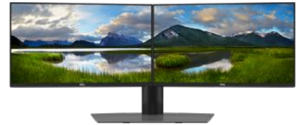
DELL 24 MONITOR P2419H WITH DELL DUAL MONITOR STAND | MDS19

Allows the Wyse 5070 to be mounted to select Dell E- Series displays.