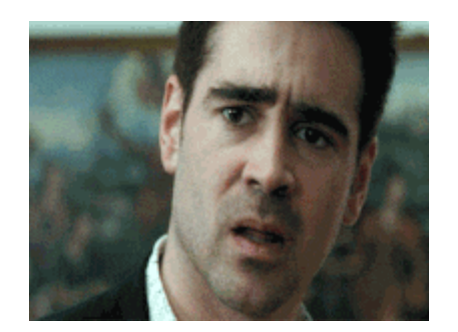
"WordPress is Just a Blog!"