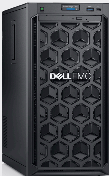
PowerEdge T140 Tower Server†

For many tasks, especially predictable ones, running them on a server can cost less than public cloud. Public clouds add flexibility and may work well for unpredictable workloads. A Dell Technologies Advisor can help you determine the right solution for your business - server, cloud or a hybrid approach.