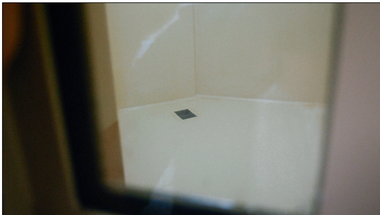
A “rubber room” used as an isolation cell for inmates at risk of self-harm. The cell has a grate in the floor where inmates relieve themselves.

inmates in segregation is often psychotropic medication. 26 Furthermore, meaningful interaction with staff and the outside world is also restricted; food and other items are usually passed through a slot in the cell's steel door, and visitation and telephone communication may be limited or banned altogether. 27 Access to fresh air and sunlight is also limited; recreation time is spent in a cage-like enclosure up to one hour per day, three to five times a week. 28 Moreover, lights in segregation are often illuminated 24 hours per day. 29