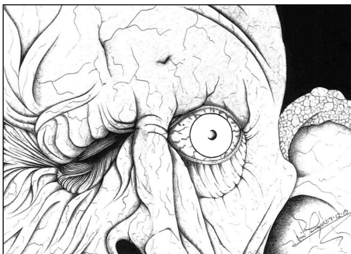
A black and white drawing of a wrinkled face with one eye, by inmate David Troupe.

Moreover, when the symptoms of a segregated inmate's mental illness escalate, the inmate may be sent to suicide watch, an even more restrictive form of segregation. While many inmates are transferred to suicide watch from another segregated setting after inflicting self-harm or attempting suicide, rather than receive therapeutic services necessary to alleviate symptoms of mental illness, inmates on suicide watch are placed under even more extreme conditions of segregation. Here, inmates are watched 24 hours a day and are generally stripped of their personal belongings, clothed in a suicide smock, and forced to urinate and defecate through a grate in the floor. 34