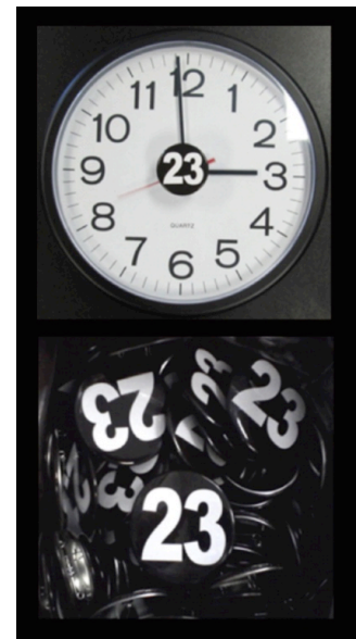
A clock with a 23-hour awareness button in the center of the dial, above a photo of a pile of 23-hour awareness buttons.

The P&A has also provided public comments to the Department of Corrections on amendments to policies and procedures, including policies regarding special management inmates (inmates who spend 23 hours per day in a cell) and mental health services. In light of the P&A’s comments, the Department decreased the duration of inmates’ initial administrative segregation stay from a maximum of 60 days to a maximum of 30 days. The Department also secured an expert for consultation on further segregation reform. The P&A has also reviewed four incidents of alleged inappropriate restraint. When a review of the Department’s secure restraint policies is complete, the P&A will provide additional comments to ensure inmates with mental illness are not being inappropriately restrained. The P&A will continue to monitor and review amendments to Department regulations, policies, and procedures that impact inmates with mental illness into the next legislative session.