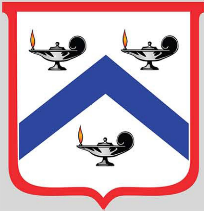
U.S. Army Combined Arms Center and Fort Leavenworth