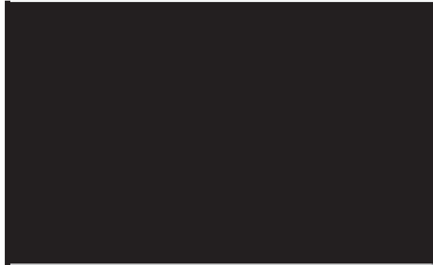
Figure 3. Example of [REDACTED] [REDACTED] Equipment Used for Advanced Searches of Mobile Devices