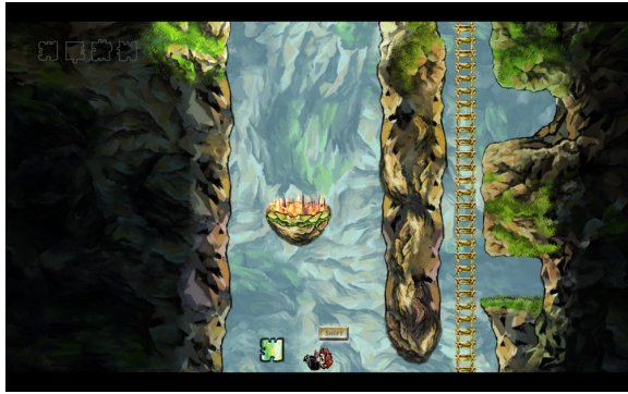
Figure 2: Braid teaching time rewinding mechanic when the player dies.

malizing the game logic of Minecraft into rules, they were able to create action graphs representing the player experience, and create quests and achievements based off those actions.