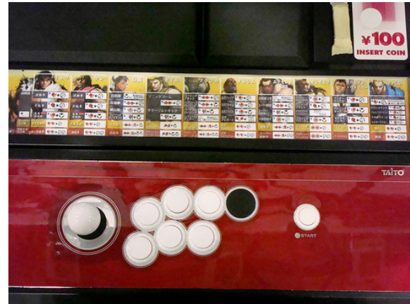
Figure 1: Street Fighters arcade cabinet. The cabinet shows different combos that can be done.

A game can have more than a single tutorial type from the previous list. Arcade games used demos and instructions to both catch the attention of the player and help them learn it. The demos help to attract more players, while simultaneously teaching them how to play. On the other hand, showing an information screen before the game start, such as in Pacman (BANDAI NAMCO, 1980), or displaying instructions on the arcade cabin, frequently seen in fighting games, helps the player understand the game and become invested in it. Figure 1 shows Street Fighters arcade cabinet where different characters combos and moves are written on it. Megaman X uses a carefully designed level to teach the player what to do, but still gives an example of the powershot attack if the player missed it.