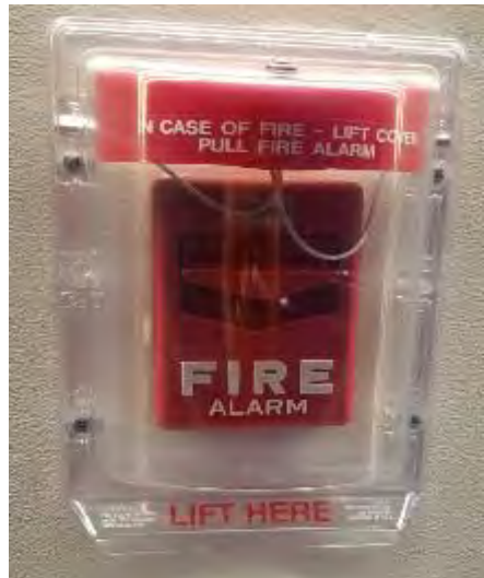
FIRE ALARM PULL STATION