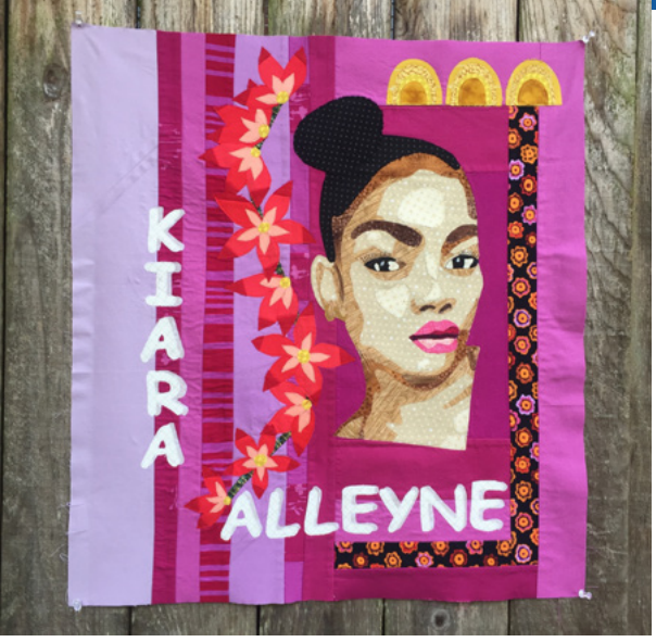
Remembrance block depicting a victim of a domestic violence that Tamara contributed in support of a national project honoring lives through symbolism and art.