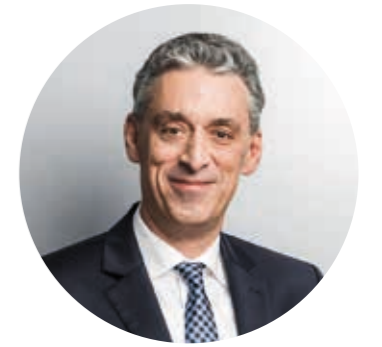
Frank Appel CEO - Deutsche Post DHL Group