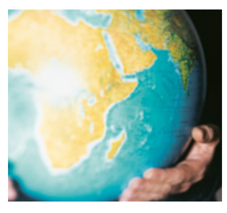
GLOBAL SCALE, LOCAL PRESENCE

We have a global customs network to facilitate the movement of goods no matter where you trade: