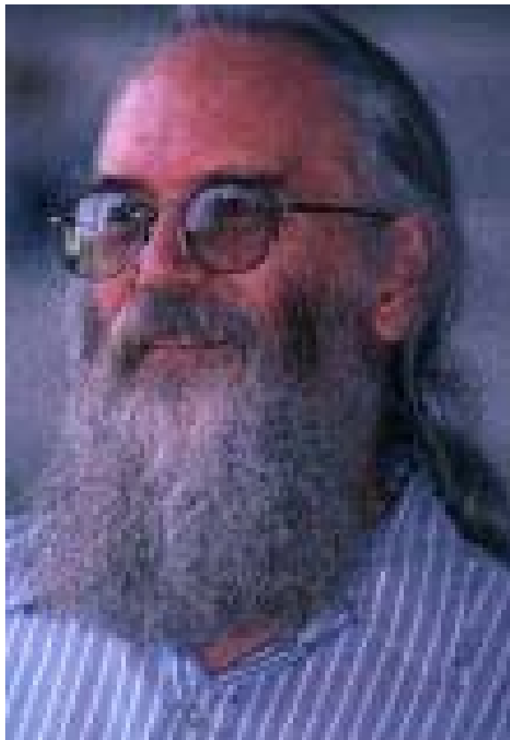
Jon Postel 1943-1998