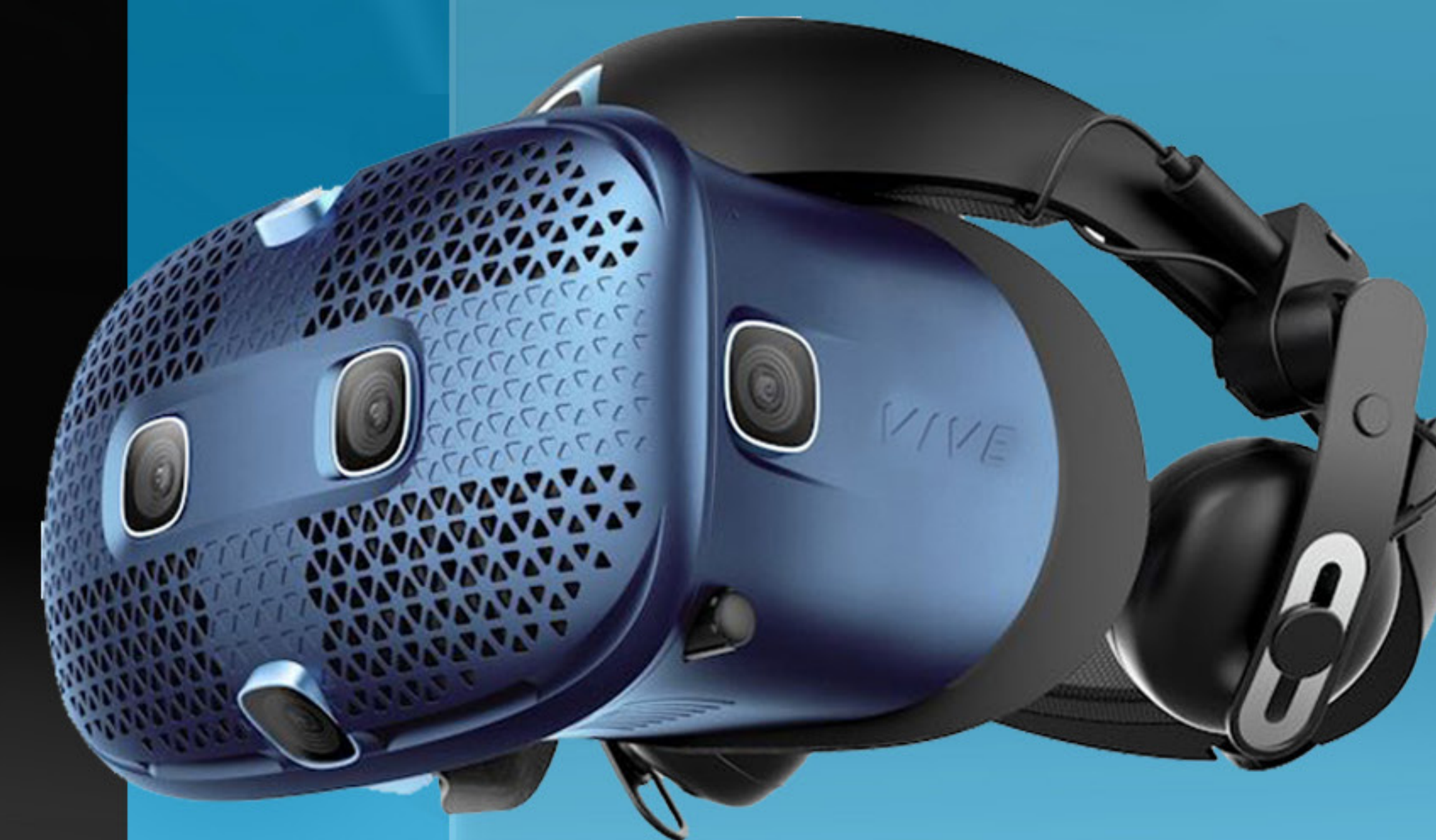
HTC VIVE COSMOS