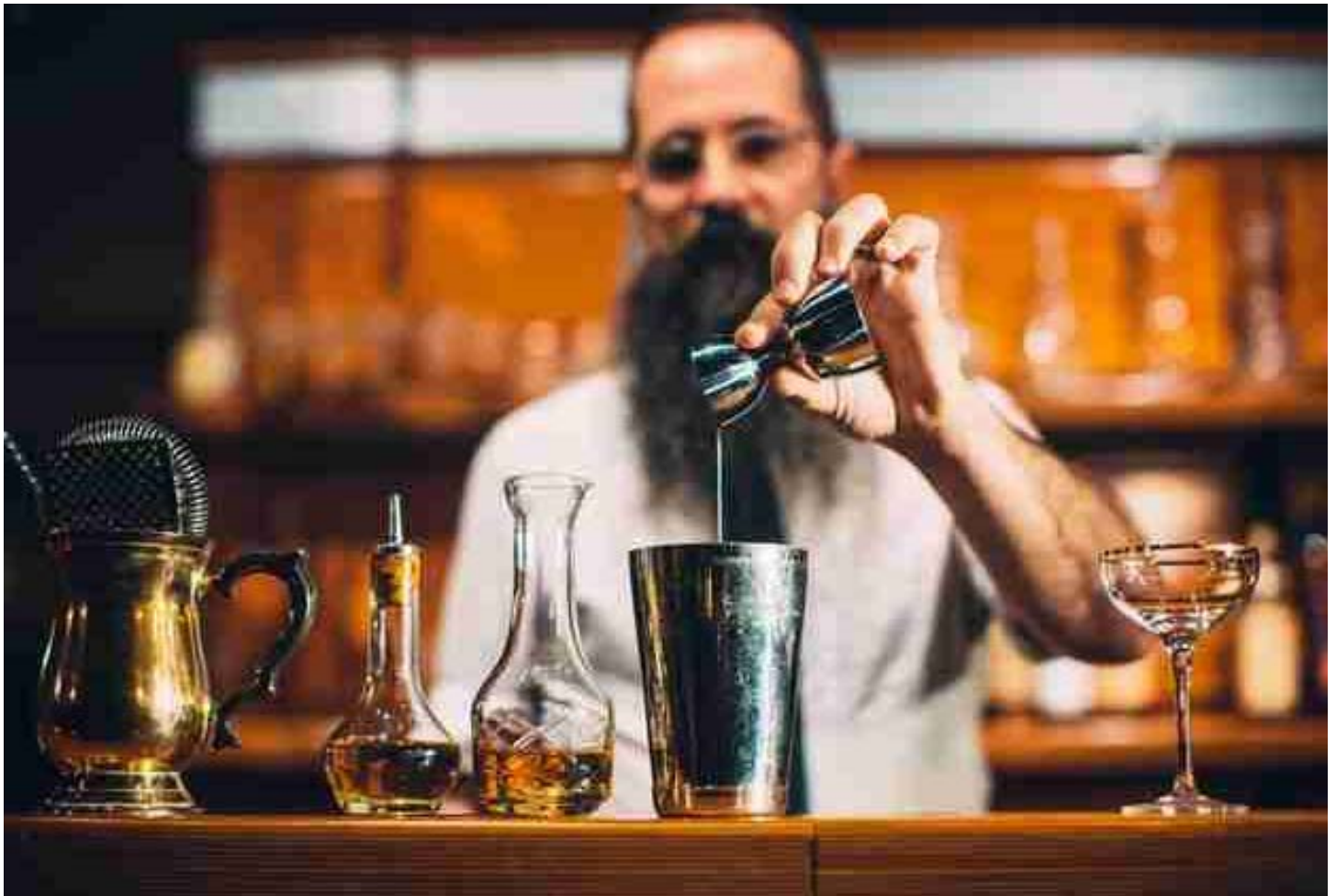
MILK ROOM CHICA