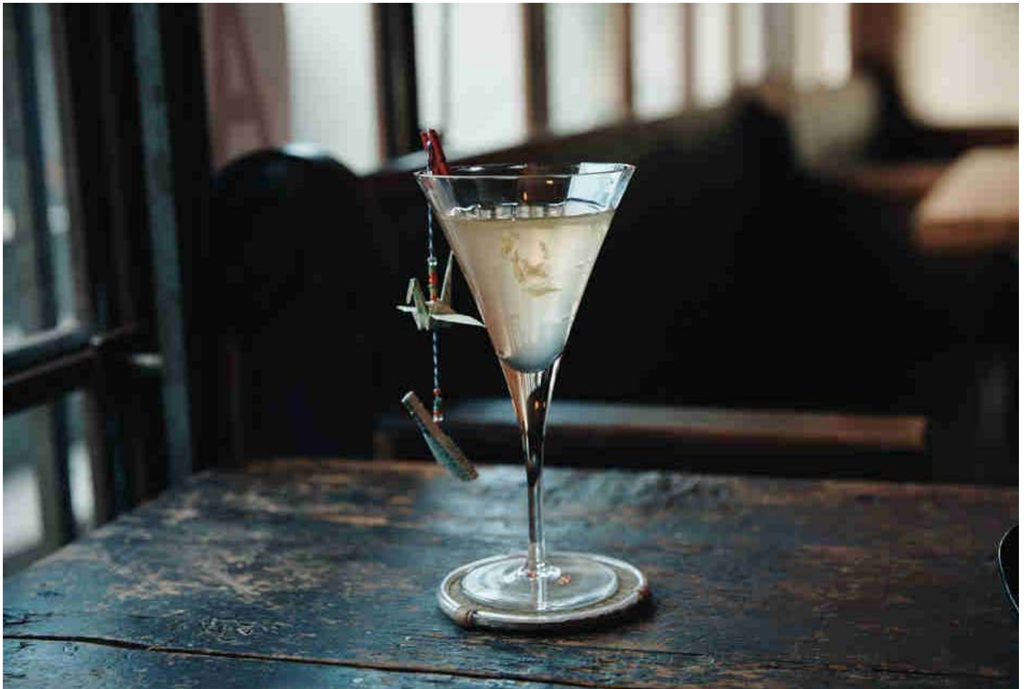
ROKC NEW YORK COCKTAIL | ZENITH RICHAI