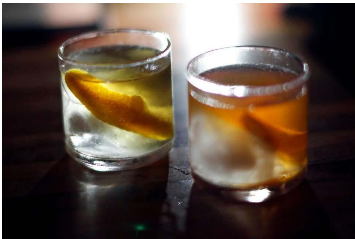
Oaxaca Old-Fashioned (left) and Improved Calvados Cocktail at the Interval in Fort Mason.