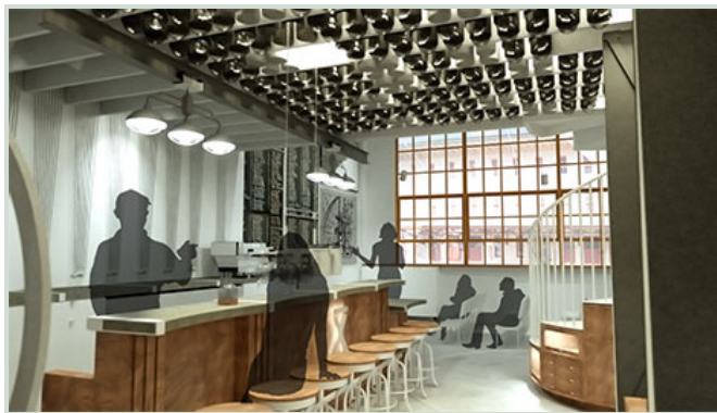
Rendering of the Long Now Salon