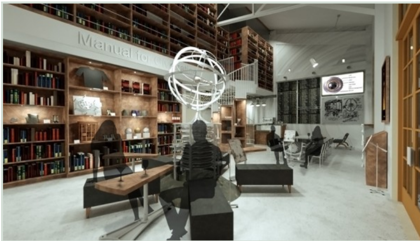
Rendering of the Long Now Salon

1 Comments | Email | Print | Share 10 | Tweet 3 | G+ 1