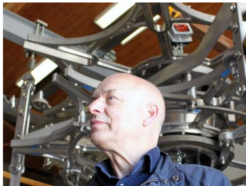
Brian Eno – a backer of the Long Now Foundation – looks at parts of the clock in construction.

They've put a substantial amount of thought