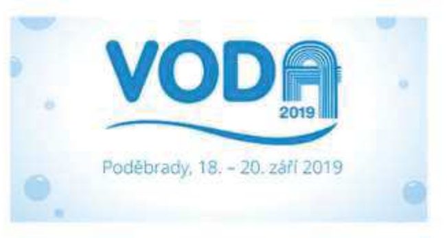
More information: http://www.czwa.cz/voda2019/

The main theme of the conference is wastewater reuse, actual problems and trends in water management.