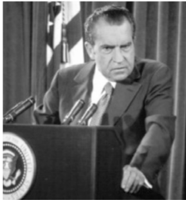
Richard Nixon = Hot Media

McLuhan is prophetic on some issues but hopelessly naive on others