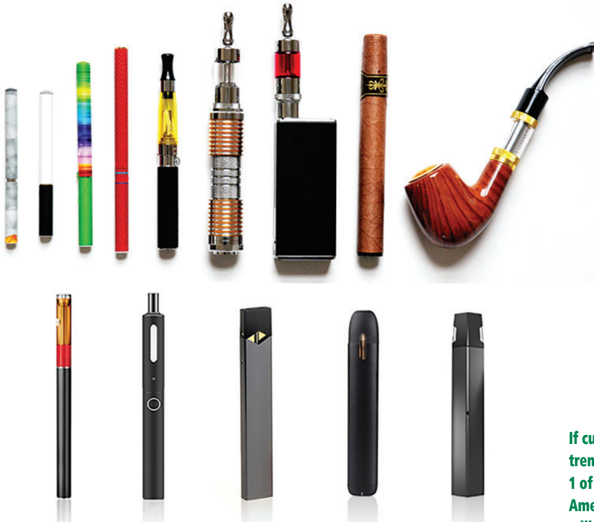
Figure 1. Various vaping devices.