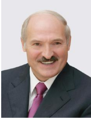
President of Belarus Alexander Lukashenko

«For a quarter of a century, the forum has become an important platform for interstate cooperation, where the latest achievements in the field of information technology are exhibited.