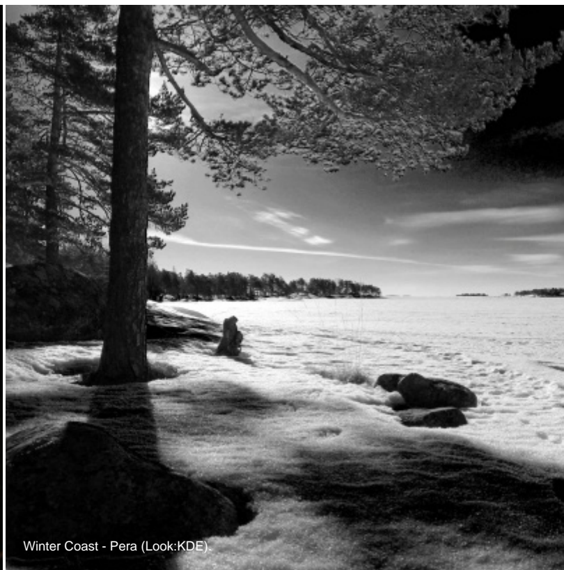
Winter Coast - Pera (Look:KDE).