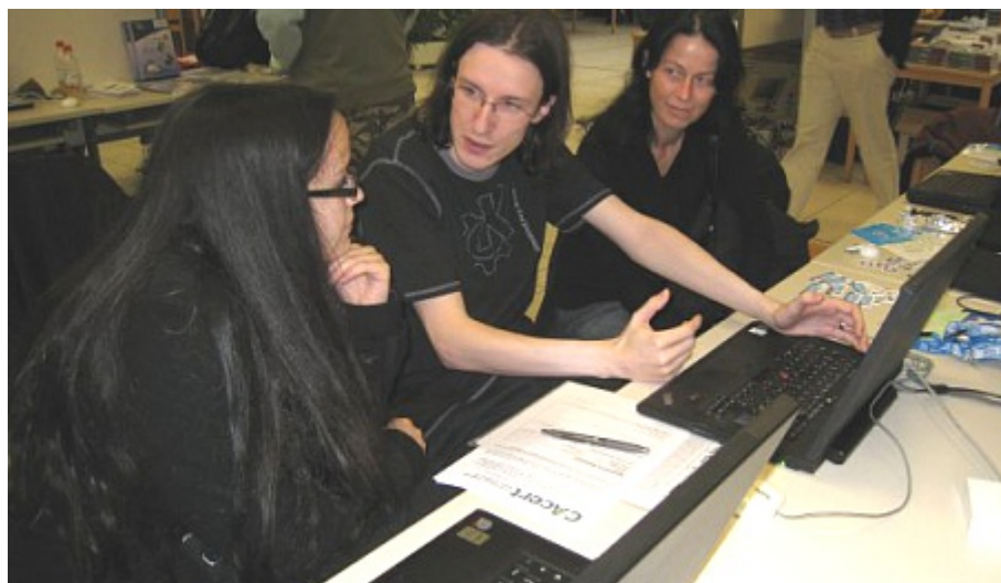
Left, Users showcase KDE to interested attendees at LinuxDay 2010.

KDE TECHNOLOGIES ARE USED EVERYWHERE. IN THE SERVER ROOM, ON THE DESKTOP, AND IN MOBILE PHONES.