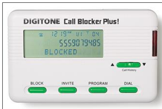
Figure A-1. Digitone Call Blocker Plus An Example of a Blocking Device